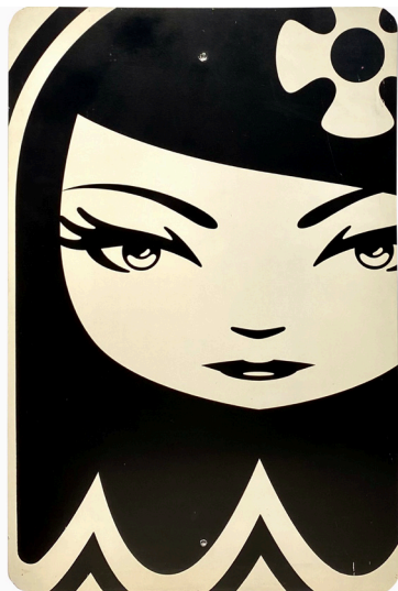
Matt Siren, Blinky Ghost Girl, 2008

The powerful silhouette of Ghost Girl is set in a variety of colors as a representation of diversity and feminism; she could represent anyone, no matter their background, size, sexual orientation, race, or ethnicity. Her universal image has become Matt Siren's signature symbol. All women are intended to be represented in Ghost Girl's robust and striking spirit.