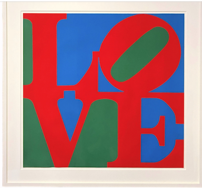
Robert Indiana - RI67, LOVE, 1967. Screenprint on paper 29 x 30.25 inches; 73.7 x 76.8 cm paper size 36.5 x 38 inches; 92.71 x 96.52 cm framed Edition: PP Unsigned