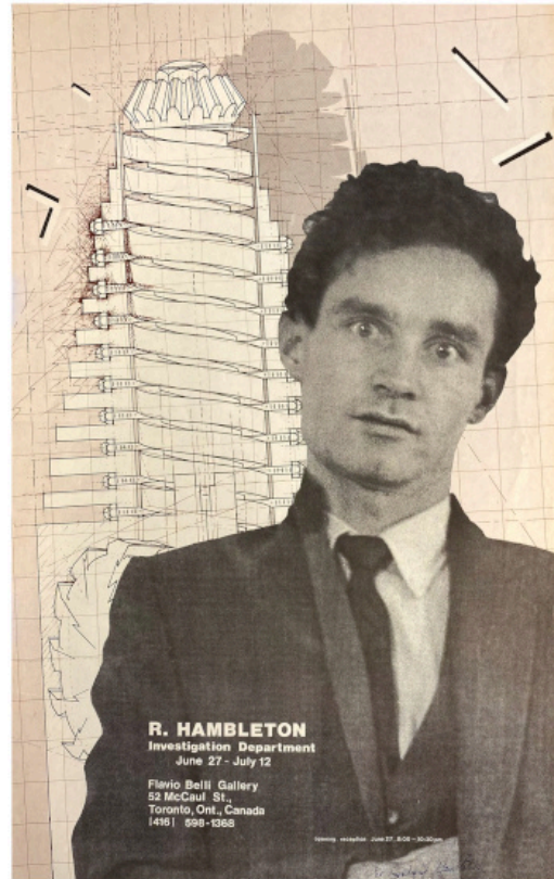
Left: Jean Michel Basquiat – Exhibition Announcement at Vrej Baghoomian Gallery, 1988 / Right: Richard Hambleton – R. Hambleton. Investigation Department June 27 – July 12, Flavio Belli Gallery, Announcement, 1981