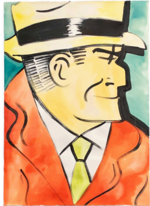
Left: Sunday B. Morning – Marilyn 23 , 1990s / Right: Crash – Dick Tracy II , 1988