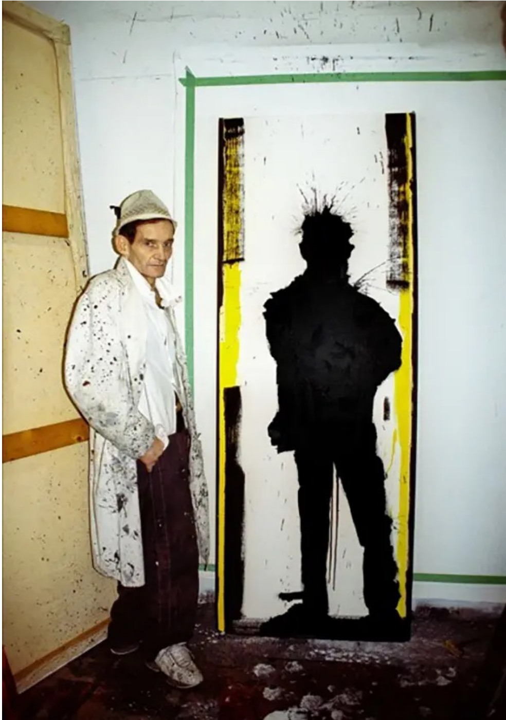
Richard Hambleton in an undated photo. His silhouette paintings earned him the nickname “the Shadowman.”