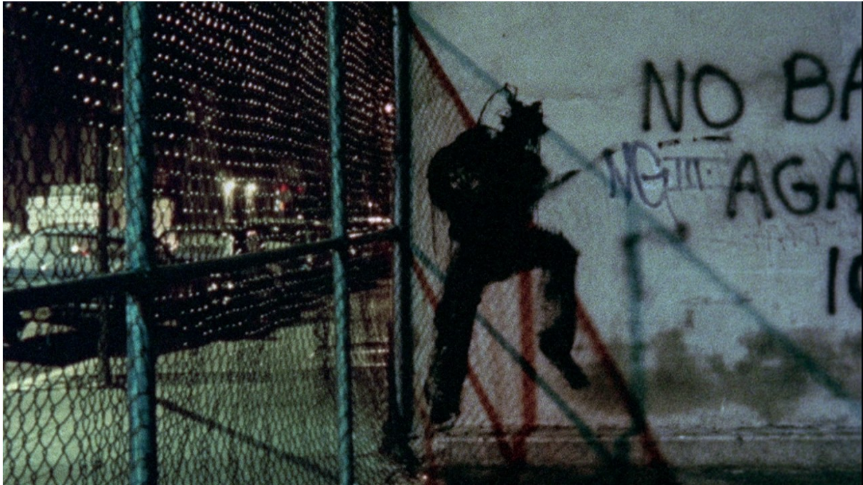
Shadowman - Exclusive Clip Video by IndieWire